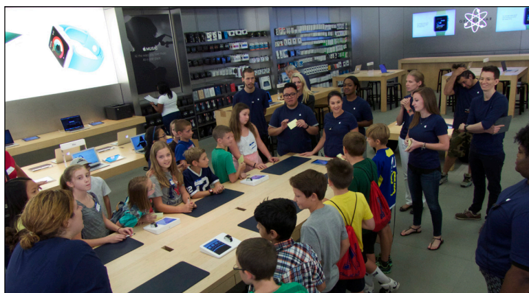
iTeam listens to Apple 'Geniuses' during their August visit

Sixth-grade students will receive their new iPads in October, while roll-out for the 5th grade will be in December.