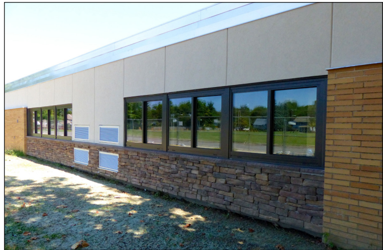
New energy-efficient windows and decorative stone walls at Hoover Elementary School