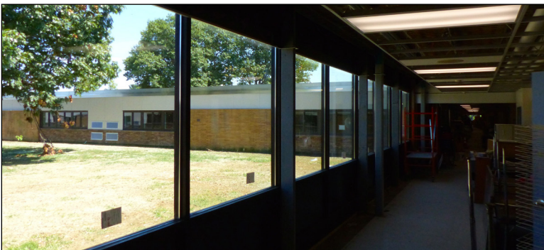
New windows at Herbert Hoover ES

saving windows, roof improvements, new electrical and plumbing systems all designed to bring these buildings up to a modern standard of comfort and efficiency.