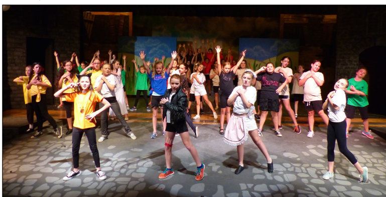
Scene from Honk! (Jr.)

Summer Fine Arts Program, staged two musicals. The program, in its 51st year, includes students from both private and public schools from Bucks and Montgomery counties.