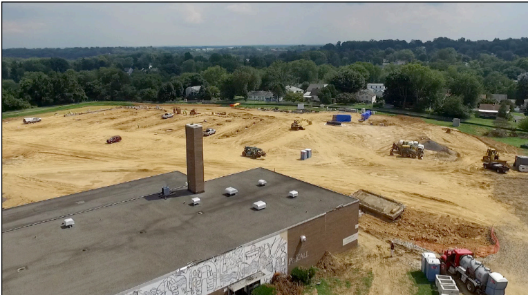
Photo showing old Tawanka building (foreground) and the footprint of the new building in the background. The ground under the old building will be used for athletic fields, parking and the driveway for the new building.

A small piece of the tile mural on the front of the old building was saved for display in the new building, as well as some Native