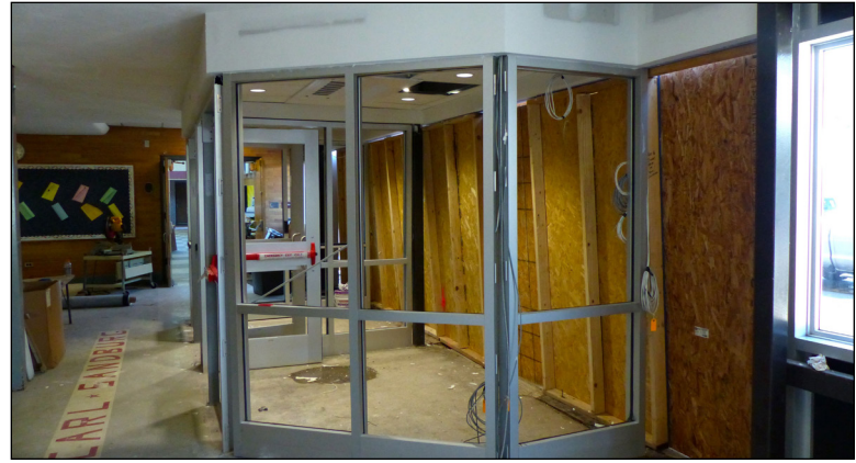
Security vestibule at Carl Sandburg MS

is entering the buildings during the school day. Vestibules will be added to other school buildings in later phases of the project.