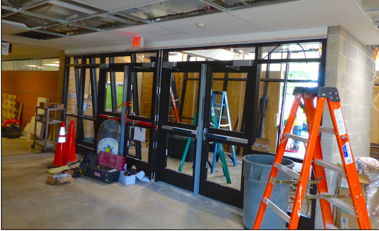
Security vestibule at Schweitzer ES.

Additional work completed at Hoover, Schweitzer and Sandburg include the installation of security vestibules, which provide a 'holding area' for visitors so the office staff can better control who