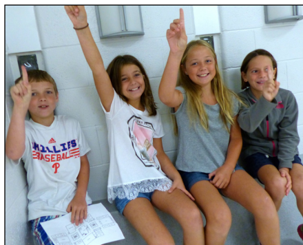
Maple Point orientation

Three recommendations that were modified include offering a traditional world language program in French and Spanish for one full year in 8th grade, adding a daily 'Whatever I Need' (WIN) period for 5th grade, and hiring an additional counselor at each middle school.