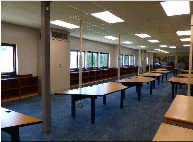
New air conditioning unit and energy-efficient windows in the library media center of Carl Sandburg MS