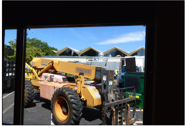
Construction equipment at Schweitzer ES and Sandburg MS

Each school received energy-saving upgrades provided under the Guaranteed Energy Savings Act (GESA), a program that allows the District to reduce operating costs by installing new HVAC systems, insulation, efficient lighting and other improvements. Each of the three schools renovated this summer will have air conditioned classrooms and office areas, double-paned energy-