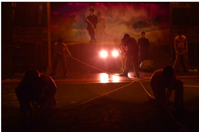
Scene from Les Miserables (School Edition)