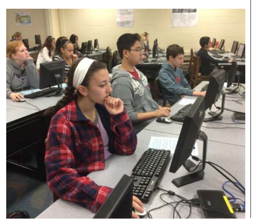
Summer (continued from page 1)

Naviance is designed to be an integral part of the high school guidance department, and even offers a messaging tool that allows students to schedule appointments with guidance counselors or just ask a question. Parents can also log in to view their children's information and progress.